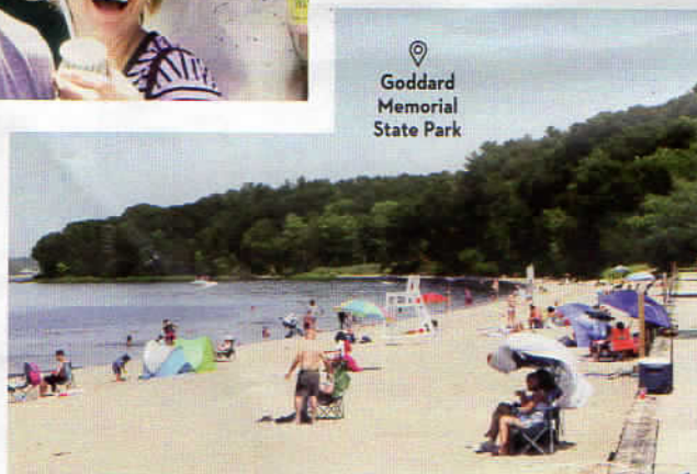
Goddard Memorial State Park